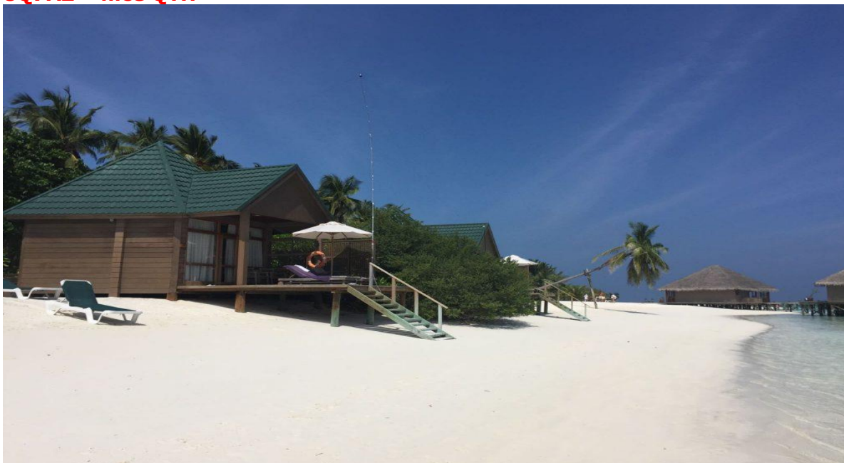
A70X AS-088 Al-Safliyah Island

On the scene by DX WORLD.net 8Q7AZ – nice QTH