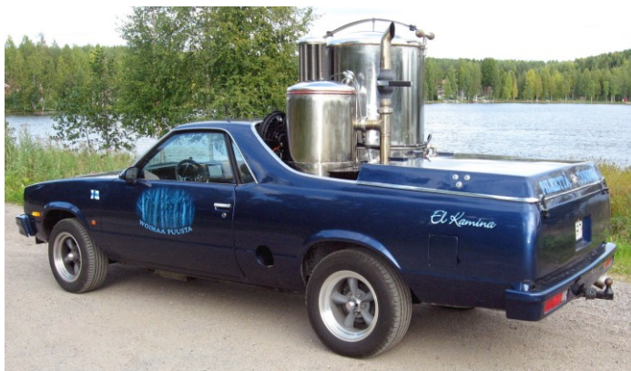
Super charged Chevrolet El Camino (renamed El Kamina), Finland

BOOK IS CONFIDENTIAL AND DELIVERED FOR PERSONAL USE ONLY AVAILABLE AS AUTHOR'S EDITION